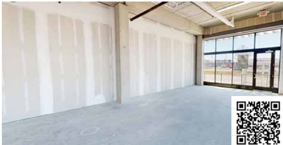
Suite 2901 - 1,083 SF