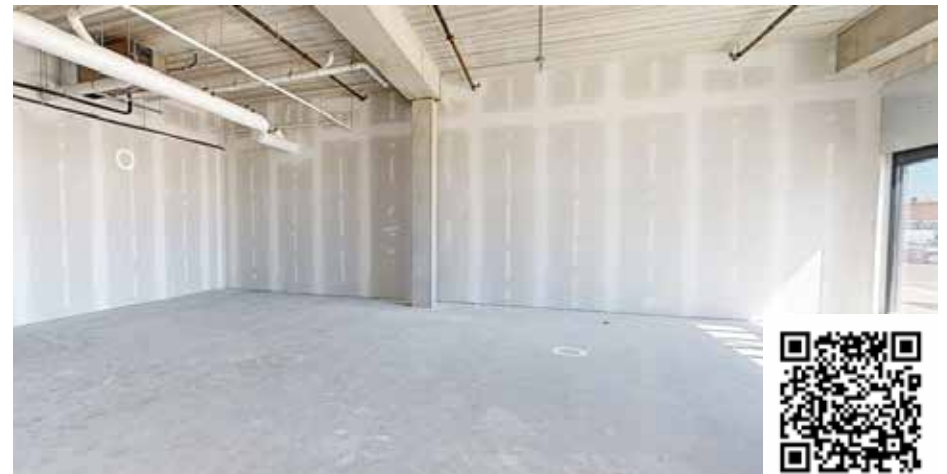
Suite 2909 - 1,439 SF